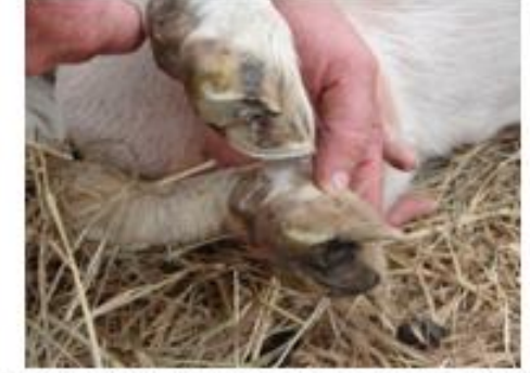
Taught a younger 4-H'er how to trim goat hooves. The hoof on top is trimmed while the hoof on the bottom is not.