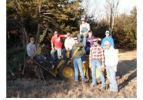
With my FFA Chapter helped clear brush & timber that is a fire hazard in the rangeland adjacent to the University Park community.