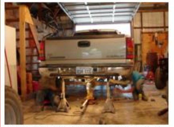
Helping my friend put a lift kit on his truck.