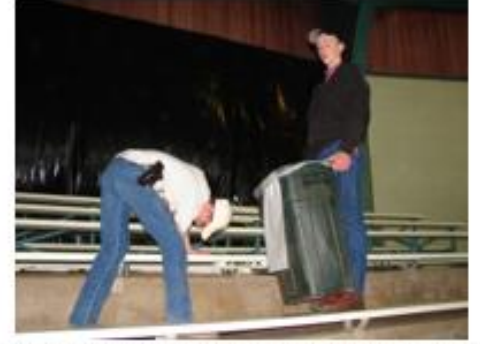
Helped pick up trash following the KSU Junior Meat Goat Producer Day.