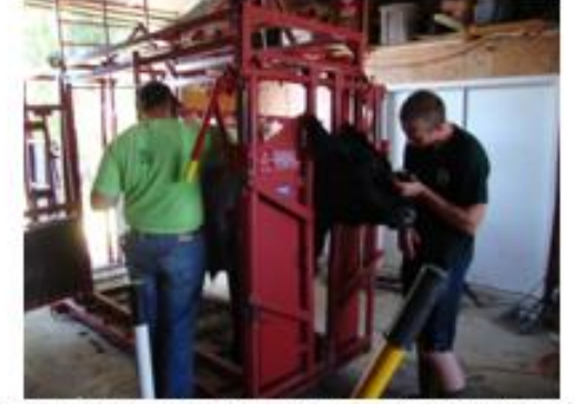
Organized a project meeting at my farm to teach how to clip a steer for show.