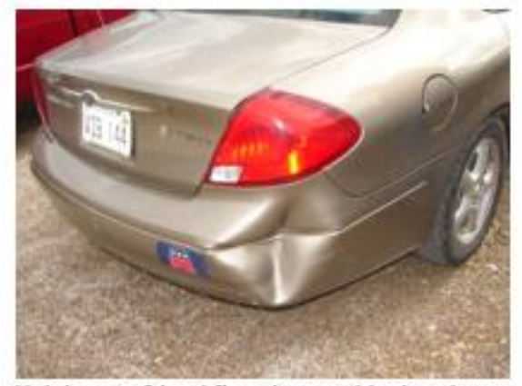
Helping my friend fix a dent on his sister's car.