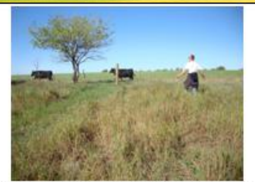
Moving my cattle to a new paddock. Due to the drought, we split our native pastures into four compartments and used rotational grazing.