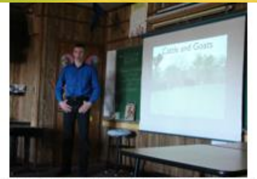
Giving an illustrated talk at county club day on the challenges of grazing & raising cattle and goats together.