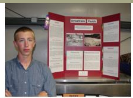
Teaching the public about drivetrain fluids thru my poster at the county fair.