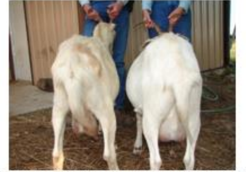
Goat on the left has a body conditioning score of 1. Goat on the right has a body conditioning score of 3.