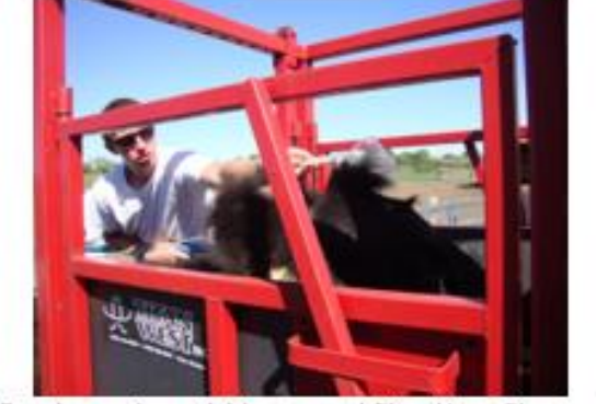
Pouring an insecticide to repel flies. Horn flies and face flies were a constant battle this summer.