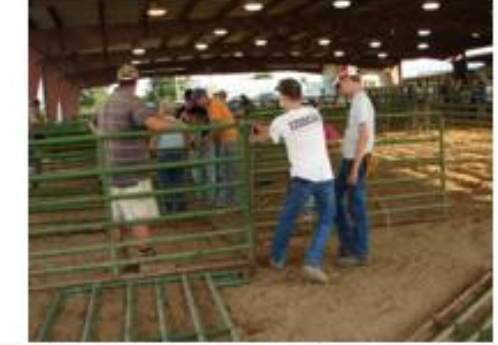
Helped set up and tear down the goat & sheep pens at the county fair.