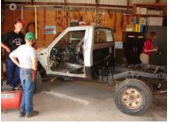
Explaining at a club tour how I am transforming a 1981 Toyota truck into an off-road vehicle.